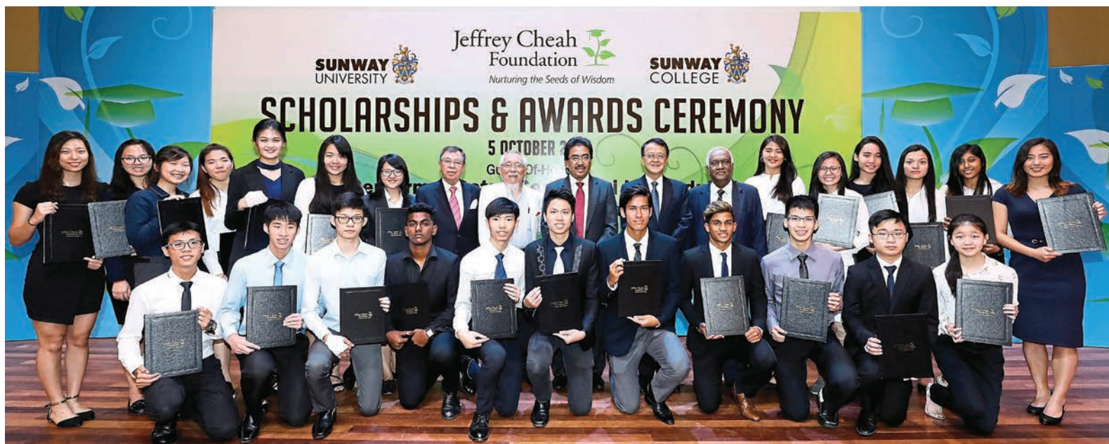
The Jeffrey Cheah Foundation has disbursed RM330mil in scholarships to help thousands of deserving students achieve their academic dreams.

The discussions brought about a deeper understanding of the effects of global economic, social and geopolitical factors that influence the progress of sustainability as well as topics such as building the right policy frameworks, sustainability in uncertain times and Asia's water imperative, and attracting capital to sustainable enterprises.