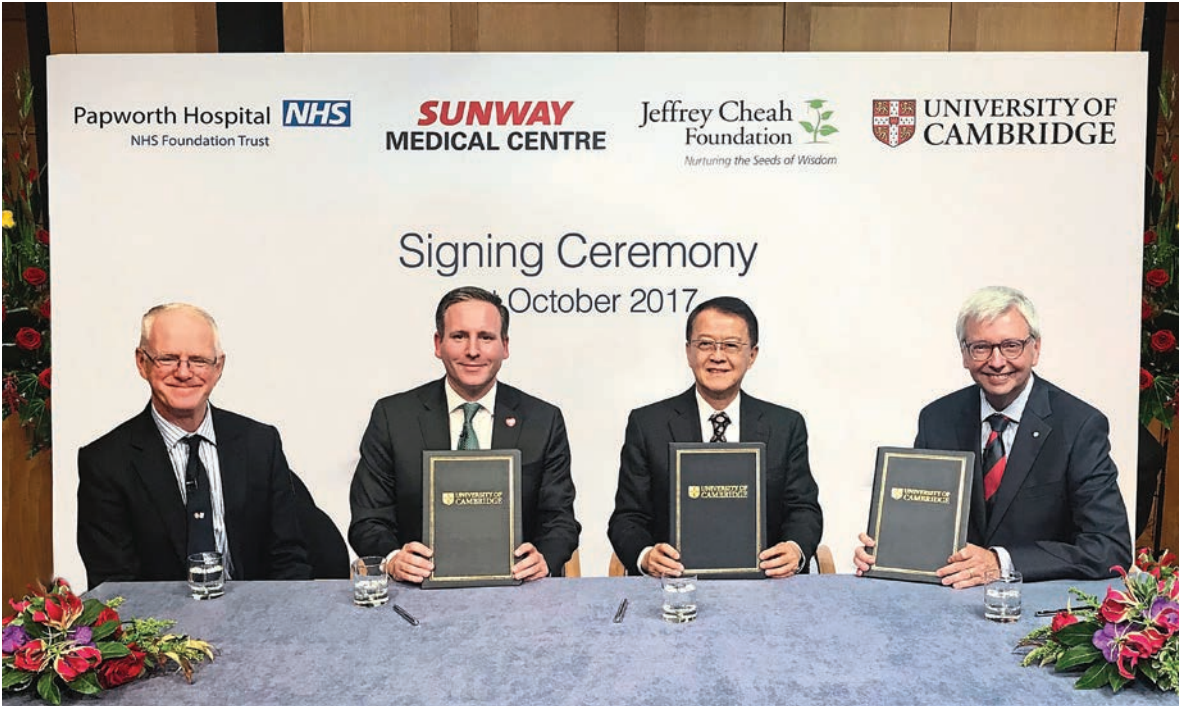
Good academic ties with the University of Cambridge allow Sunway Medical Centre to collaborate with the Royal Papworth Hospital and Addenbrooke's Hospital to become Malaysia's first private teaching hospital.